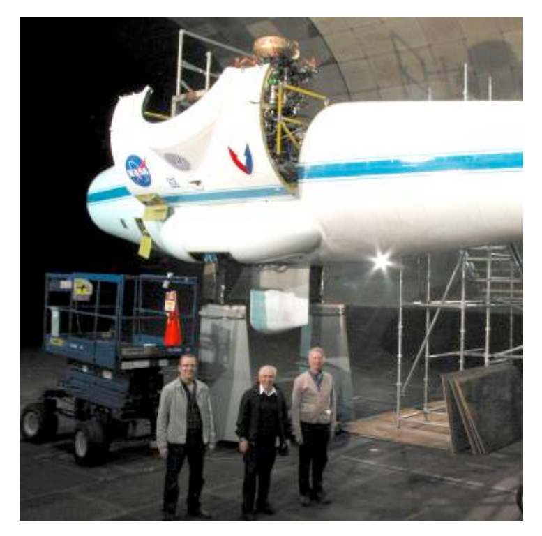
Helicopter model; RMDATS telemetry installs on top of rotor hub