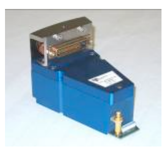
16 channel Data Acquisition Segment (DAS)