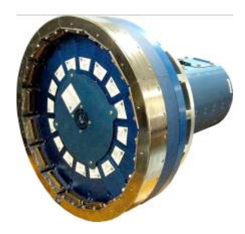
RMDATS assembly (16 DAS segments; 256 dynamic channels)