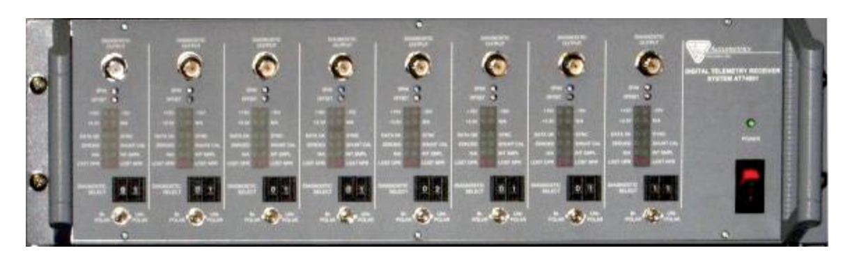
Receiver Chassis (one of two eight channel units)