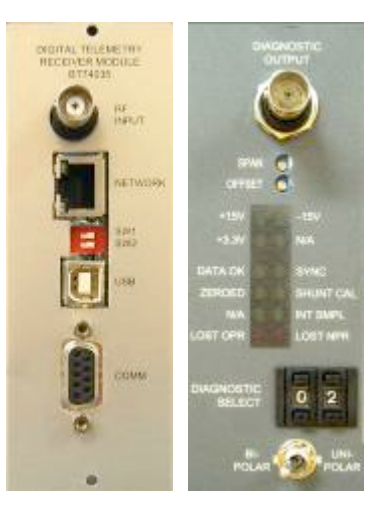
Receiver module: data stream input/ output